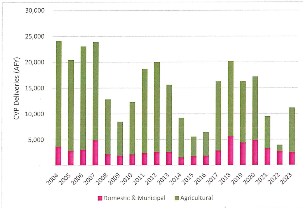
Figure 1. CVP Deliveries by User Type (WY 2004- WY 2023)

CVP and the other non-groundwater water sources are used conjunctively with local groundwater. The District has consistently worked to maintain groundwater storage in the Basin to serve as an important water source in dry years when CVP and other sources are restricted. District groundwater management projects (also described in GSP Chapter 8, Todd 2021) are focused on increasing water importation, local water storage, managed aquifer recharge, and water recycling, all of which maintain and increase local groundwater storage.